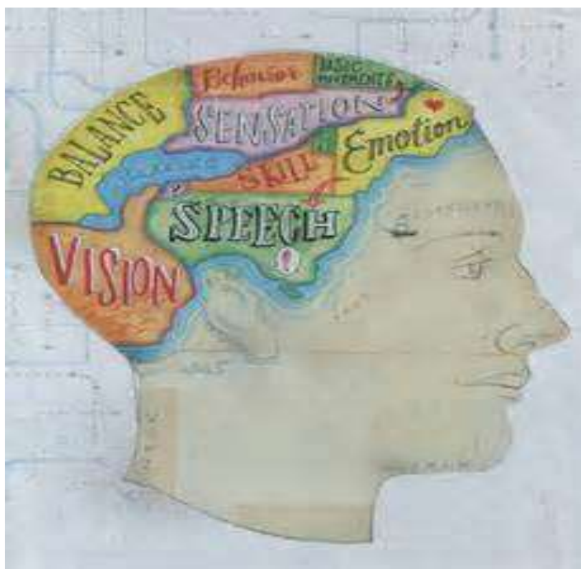
Schematic illustration of the modular brain

This study takes advantage of Fodor's Modularity of Mind and the Equipotential Theory Psychology put forward by U.S. psychologist Karl Spencer Lashley who maintains that all areas of the brain make an equal contribution to overall functioning. In some aspects, the notion put forward by the U.S psychologist is close to the plasticity (i.e. flexibility) idea which argues that after hemispherectomy the remaining hemisphere attempts to take over the functions of the missing one. Let's first deal with the modularity notion of Jerry Fodor which posits that there are functionally specialized regions in the brain that are domain specific for different cognitive processes. In this work our chief focus of study is translation but as translation is a mental activity inevitably we draw unconsciously on cognitive study and its ramifications.